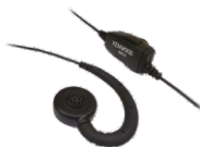
KHS-34 C-Ring In-line PTT Headset (Single Pin Jack)